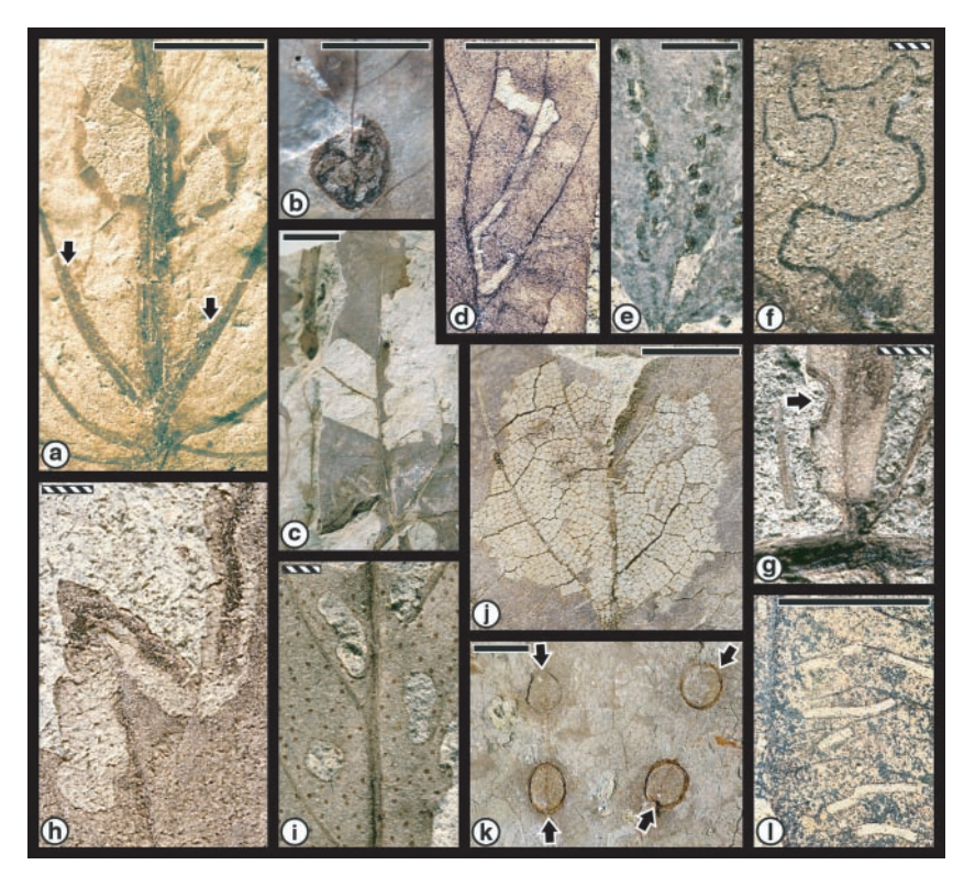
Fig. 1. A spectrum of plant–insect associations from the Williston Basin of southwestern North Dakota. Associations range from the earliest Paleocene at upper left, 14.4 m above the K/T boundary, and continue to the older associations of the latest Cretaceous at lower right, 85.5 m below the boundary. All material is from the Denver Museum of Nature and Science (DMNH) or the Yale Peabody Museum (YPM). Following each plant host are, respectively, morphotype number (indicated by the prefixes HC or FU) (17), specimen number, DMNH locality number (loc.), and ± meter distances from the K/T boundary as in Fig. 2 (17). Damage types are indicated by the prefix DT (Fig. 2). (Scale bars: solid = 1 cm, backslashed = 0.1 cm.) (a) Two linear mines with oviposition sites (arrows), following secondary and then primary venation, terminating in a large pupation chamber (DT59), on the dicot Paranymphaea crassifolia (FU1), DMNH 20055, loc. 563, +14.4 m. (b) Single gall (DT33) on primary vein of Cercidiphyllum genetrix (Cercidiphyllaceae, FU5), DMNH 20042, loc. 562, +8.4 m. (c) Free feeding (DT26) on Platanus raynoldsi (Platanaceae, FU16), DMNH 20035, loc. 2217, +1.3 m. (d) Skeletonization (DT61) on a probable lauralean leaf (HC32), DMNH 19984, loc. 2097, -31.4 m. (e) Multiple galls (DT33) on Trochodendroides nebrascensis (Cercidiphyllaceae, HC103), DMNH 19976, loc. 1489, -33.7 m. (f) Initial phase of a serpentine mine (DT45) on Marmarthia pearsonii (Lauraceae, HC162), DMNH 7228, loc. 2087, -36.9 m. (g) Cuspate margin feeding (DT12, arrow) on Metasequoia sp. (Cupressaceae, HC35), DMNH 13108, loc. 567, -56.8 m. (h) Serpentine leaf mine (DT43) assigned to the Nepticulidae (Lepidoptera), on unidentified Rosaceae (HC80), YPM 6367a, loc. 567, -56.8 m. (h) Serpentine leaf mine (DT43) assigned to the Nepticulidae (Lepidoptera), on unidentified Rosaceae (HC80), YPM 6367a, loc. 567, -56.8 m. (h) Serpentine leaf mine (DT43) assigned to the Nepticulidae (Lepidoptera), on unidentified Rosaceae (HC80), YPM 6367a, loc. 567, -56.8

Each specimen was inspected for insect-mediated damage, which when present, was assigned to one or more of 51 insect damage types (Figs. 1 and 2). Herbivory was recognized on the basis of four explicit criteria, which were used singly or in combination. These criteria were: the presence of reaction tissue; anatomic details of the cut margin, such as excision cusps made by mandibles; stereotypy based on pattern, position, or size and shape of the damage; and plant-host specificity (24, 33). Each damage type then was classified into one of four functional feeding groups: external foliage feeding, subdivided into margin feeding, hole feeding, skeletonization, and special types of external feeding damage; galling; mining; and piercing and sucking; as well as a separate, nonfeeding damage type for oviposition. Additionally, we assigned each damage type to one of three categories based on the degree of plant-host specificity typically but not exclusively found in various insect species producing the same damage type today (24): generalized for polyphagy, intermediate for oligophagy, and specialized for monophagy. We note that some occurrences of damage types within our generalized category undoubtedly represent feeding by specialist as well as generalist insects, thus biasing toward a conservative estimate for specialist extinction. Host specificity assignments were based on published surveys of modern plant