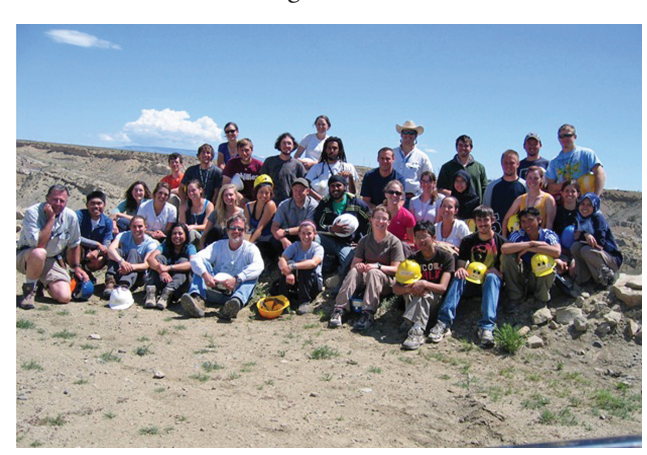
Figure 2. 2010 Field Camp Class in Elk Basin.

But the tools of the trade have evolved. Students still use Bruntons, rock hammers, 10x hand lenses, and good old 10% HCL. But instead of making topographic maps with a plane table and alidade they are provided with laptop computers, arcMAP software, and a geographic information system (GIS) consisting of digital elevation models, high-resolution orthorectified aerial photos, and georeferenced 1:24,000 USGS quadrangle maps. Each mapping team receives (Continued on page 13)