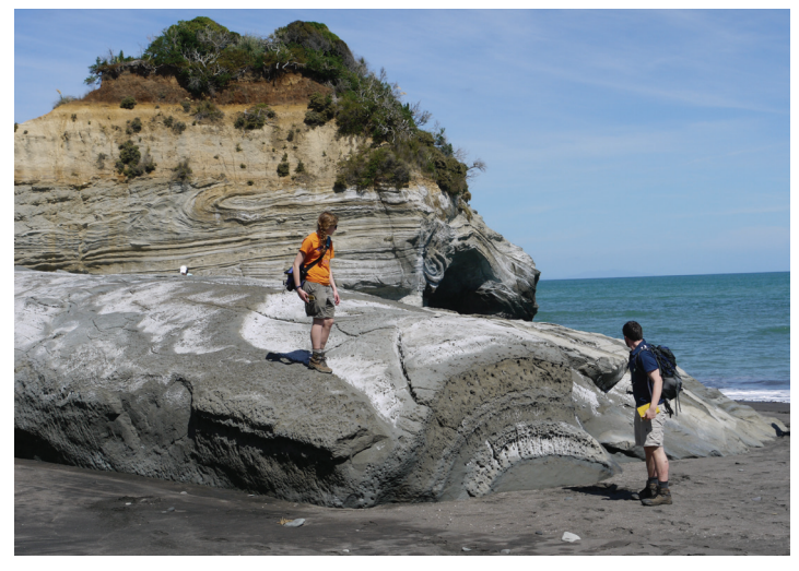
Jam Roll section (Late Miocene, Mt Messenger Formation) showing substantial mass transport deformation [PSU Grad students, Rachel Piotraschke and Bryan Kaproth]

New Zealand provides a unique opportunity to study basin evolution in a complex plate boundary system. The plate boundary through New Zealand has a Cenozoic to present history including extensional, transpressional, and subduction tectonics. A series of basins have developed in response to this history, and subsequent and ongoing basin inversion exposes key components of these basins' histories. Recent progress in plate tectonic studies of New Zealand's evolution provide key kinematic constraints and a conceptual tectonic framework for placing basinal observations into transferable, process-based basin models.