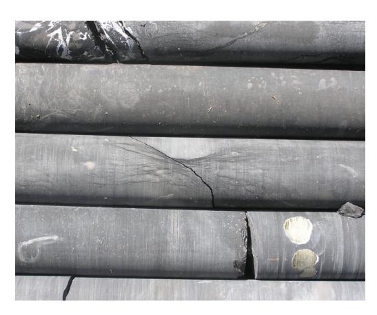
Appalachian Basin Black Shale Group core from the Marcellus Formation of central Pennsylvania. This core has been tectonically deformed as indicated by the vertical fibrous growth on pyrite nodules, tectonic cleavage wrapping around a concretion, and a calcite-filled fault zone