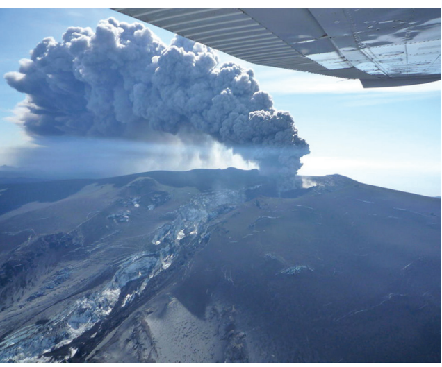
A view towards SE of Eyjafjallajökull on May 8th, 2010 during the summit eruption. The otherwise shining white ice-cap is now covered with tephra. Glacial outburst floods from ice melting in the summit crater have disrupted the outlet glacier going from the crater to the lowlands.