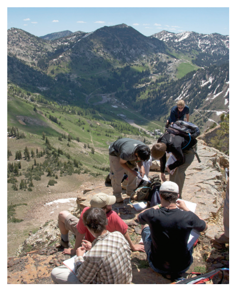
Duff's Bench, Alta, Utah

I formed many special bonds with my fellow field campers, something I feel my colleagues as well as alumni can echo about their respective experiences. We laughed, complained, celebrated, struggled, and grew as one united group of students with the same passion – understanding the Earth and its past. Over the time and the miles, we learned more about field geology, each other, and ourselves. I want to personally thank all those involved for making seven weeks and 8100 miles so enjoyable and memorable, including the professors, alumni, teaching assistants, and those students I can call my friends, those of Penn State Field Camp 2009: 26 men and three women.