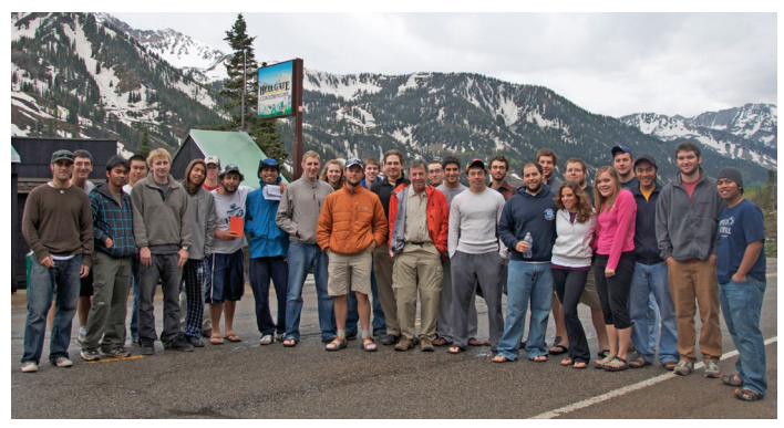
Group at Alta, Utah

Penn State Field Camp 2009: Seven weeks and 8100 miles, 26 men and three women, eight exercises and many firsts. For some, it was their first cross-country road trip. For others, sleeping in tents was new and exciting. For all, it was a time that we won't soon forget, a time spent with friends old and new, in some of the most beautiful spaces America has to offer.