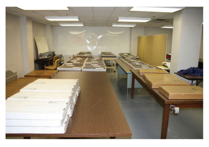
The Penn State Core Laboratory (located on the 2nd floor of Research West)

Based on the success of the coring program to date, ABBSG plans an additional solicitation for funds from operators. Our goals include the purchase of two essential pieces of equipment: 1) a non-destructive core-logging/scanning system including spectral gamma-ray, spectral color, magnetic susceptibility and p-wave velocity; and 2) a whole-core, non-destructive x-ray fluorescence device for fine-scale geochemical analysis. Other funds will be used to support graduate student research that contributes to the heart of the predictive whole-basin model for the Marcellus. Penn State's core-analysis laboratory is being designed as a research and training facility for graduate students, particularly those whose careers might take them into the gas-shale industry, and as a resource for energy companies.