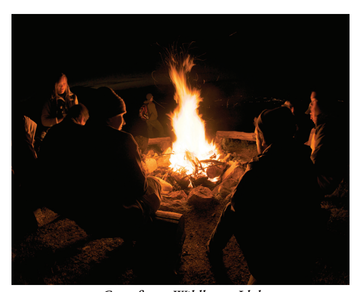
Campfire at Wildhorse, Idaho

Penn State Field Camp 2009: Seven weeks and 8100 miles, 26 men and three women, eight exercises and many firsts. For some, it was their first cross-country road trip. For others, sleeping in tents was new and exciting. For all, it was a time that we won't soon forget, a time spent with friends old and new, in some of the most beautiful spaces America has to offer.