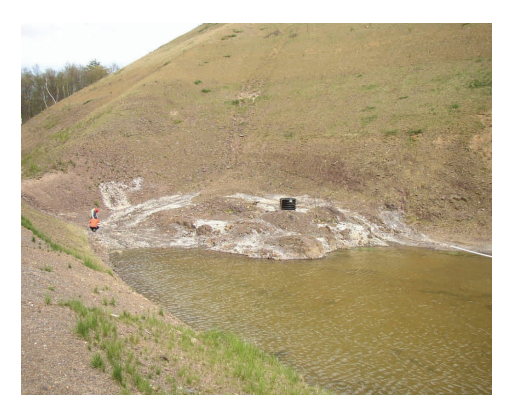
1. Efflorescent mineral bloom (white patches) at base of Siebert Waste rock site, adjacent to Siebert Pond, after prolonged dry spell.

The apparent stall of construction along Interstate I-99 at Skytop during the past year belies intense, multifaceted efforts to resolve acid pollution from weathering of inadvertently disturbed pyritic rock. The problem arose when more than 1 mil-