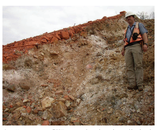
3. "Buttress fill" trench showing limited penetration of bauxsol (red) slurry over white efflorescent minerals (including green rust and gypsum) in layers of "baghouse lime", and sulfate encrustations.

blooms. Outflow waters ideally should have pH's of 6-9 and must not be excessively acid, caustic, or toxic.