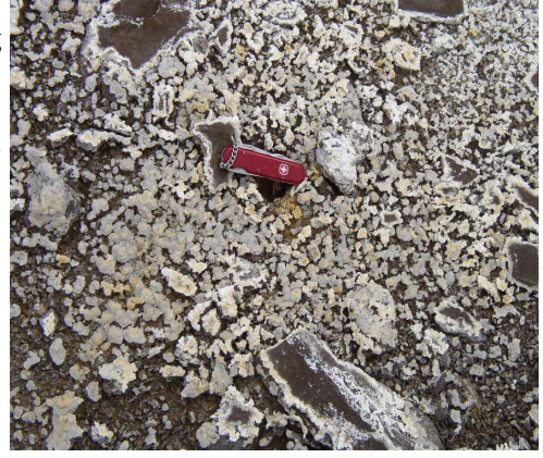
2. Four overgrowths of efflorescent minerals (gypsum, pickeringite, epsomite, alunogen).

quality stream." an option-limiting legal imperative that mandates moving all polluting crushed rock out of that drainage basin. Remediation must address both the widely dispersed, excavated rock and the immovable pyritic rocks exposed in new road-cuts. In addition, some of