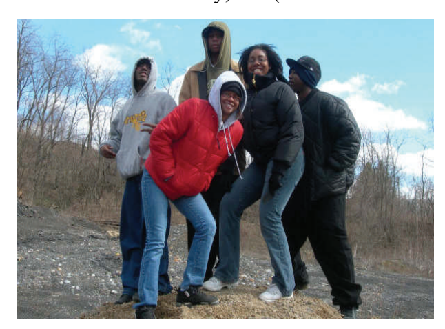
FVSU students on field trip in PA, March 2006

FVSU in Fort Valley, GA (90 minutes south of At-