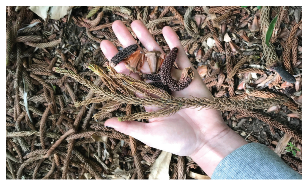
Leaf litter from an Australasian-type Araucaria growing at the Huntington Library, Art Collections, and Botanical Gardens, San Marino, California. Pictured are the three types of tree organs, leafy branches, pollen cones and cone scales that are preserved as fossils at Laguna del Hunco and Río Pichileufú, Patagonia, Argentina.

The National Science Foundation, National Geographic Society, Botanical Society of America, Geological Society of America, and Penn State provided funding for this project.