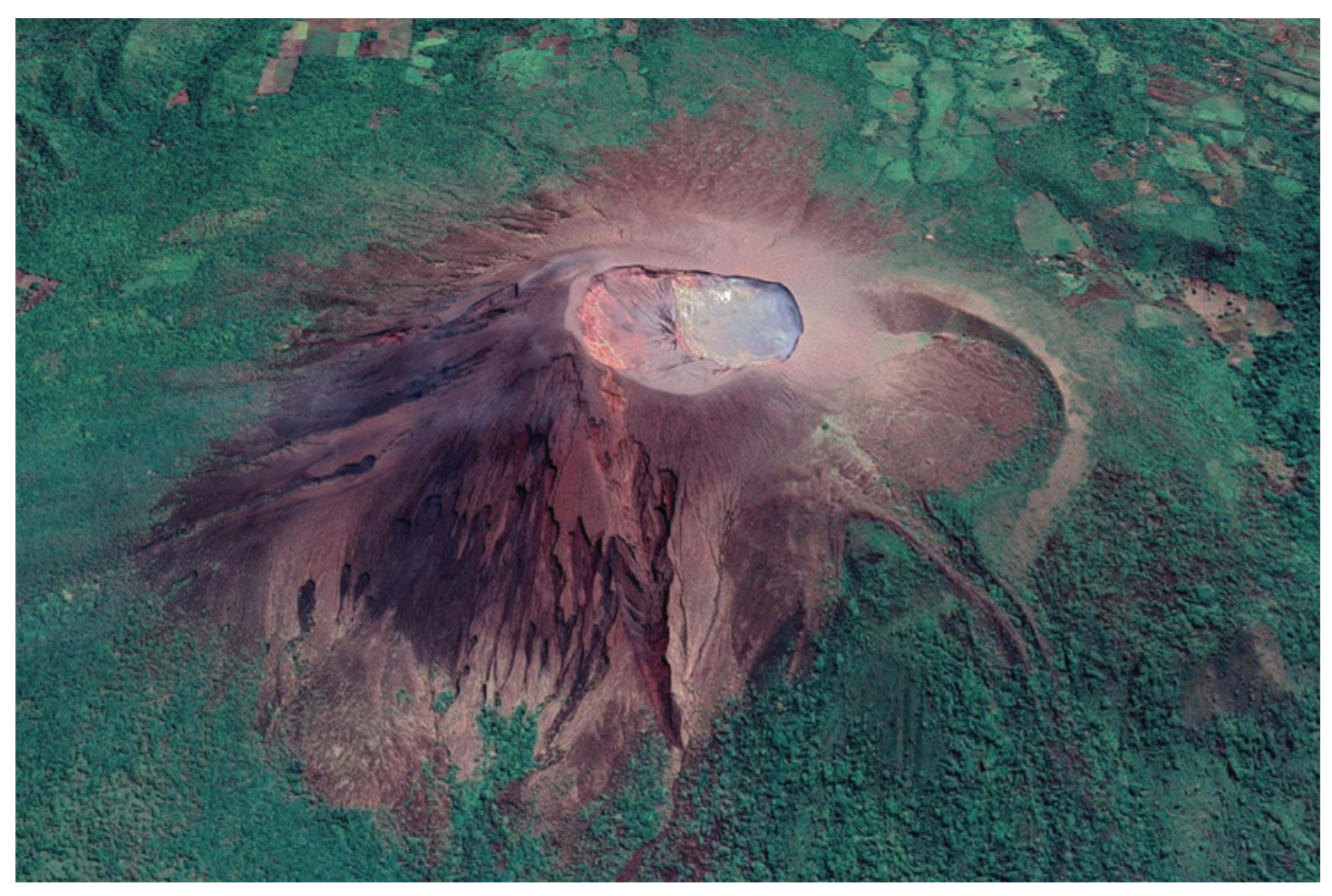
A team of Penn State researchers studied Telica Volcano, a persistently active volcano in western Nicaragua, to both observe and quantify small-scale intra-crater change associated with background and eruptive activity.

The shape of volcanoes and their craters provide critical information on their formation and eruptive history. Techniques applied to photographs—photogrammetry show promise and utility in correlating shape change to volcanic background and eruption activity.