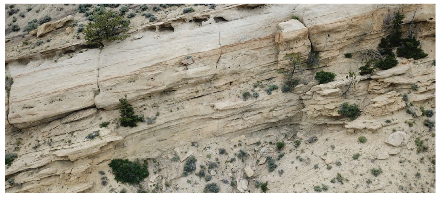
Students in the virtual geosciences field camp used drone footage, Google Earth, images and mapping software to recreate traditional scenes such as the Elk Basin, shown here in 2018.