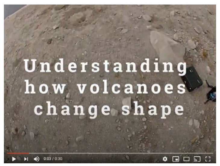
Watch video on YouTube: https://www.youtube.com/ watch?v=UxSNXa5oydo

The National Science Foundation and NASA PA Space Grant WISER program fellowship partially funded this research.