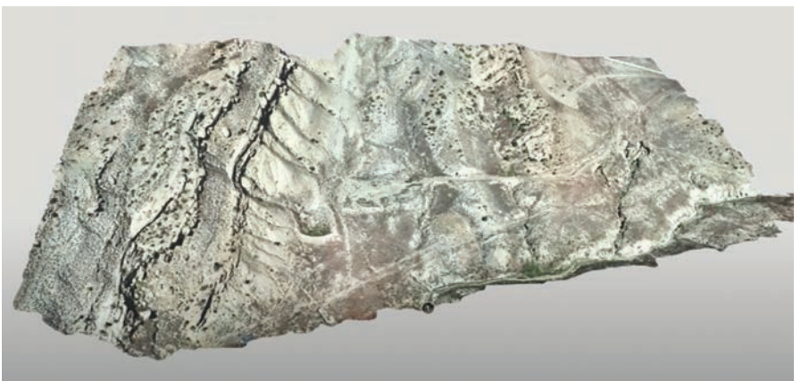
3-D model of the stratigraphy at Elk Basin.