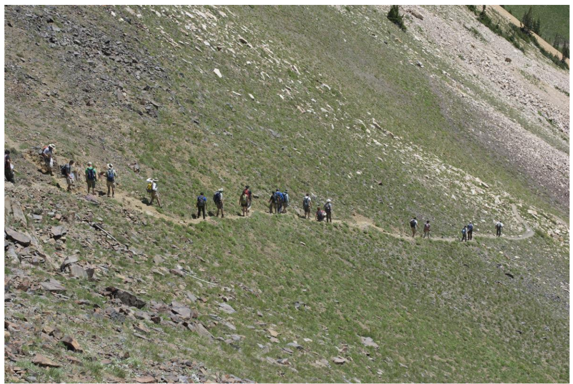
The students descend from Duff's Bench during a day of introduction to the stratigraphy of the Alta area and the mapping of ramps and flats in faulted rocks of the Sevier thrust belt.