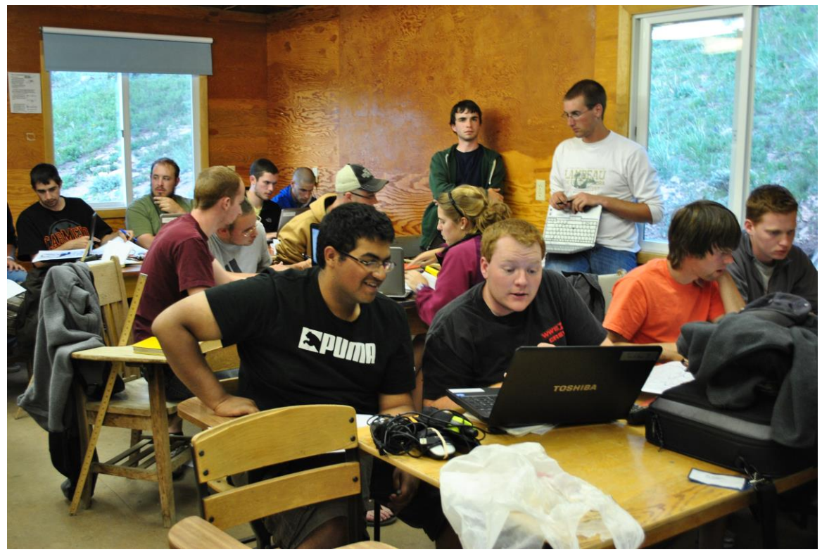
At YBRA, we take advantage of the Dusenberry classroom. Nearly all the exercises are completed in an ArcGIS format, and the students carry GPS units, locator devices, and two-way radios in the field, but some things at PSU field camp do not change. Students still use aerial photos, maps, and cross sections to develop a 3-D understanding of the geometry of geological features and the variability in geologic processes, so they can communicate their findings in reports.